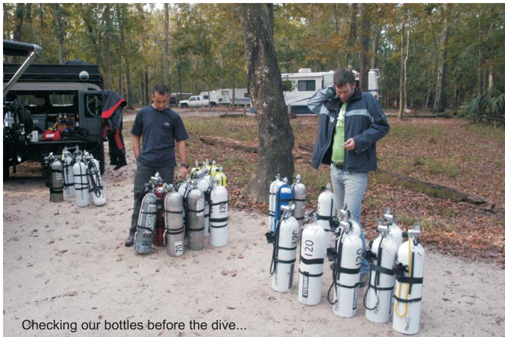
Checking our bottles before the dive...