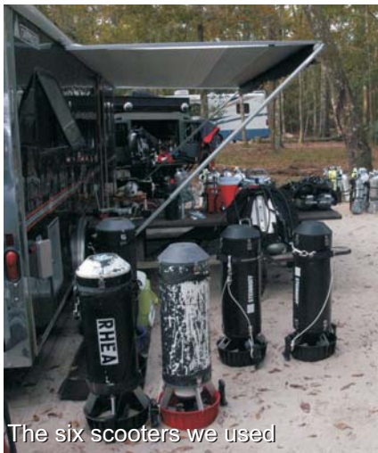
The six scooters we used