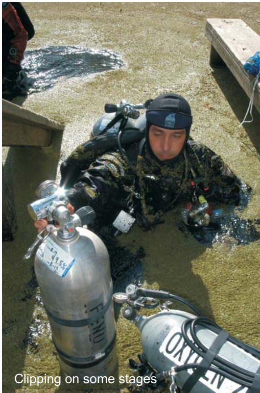
Clipping on some stages

the only ones there. We motored up to get our second scooter and the four stages we were going to bring; two stages for breathing and two stages that we were going to place in the cave for tomorrow's dive.