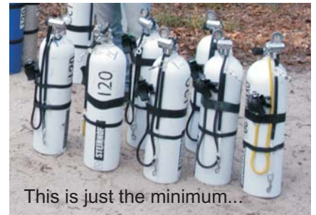
This is just the minimum...

It is also easy to underestimate the preparations required to do any of this. Just keeping your gear in perfect order gets progressively more time consuming. If you are doing longer dives you will probably have four or five scooters, around 20 regulators, at least as many stage and deco bottles, several primary lights, a couple of drysuits, probably a rebreather and the